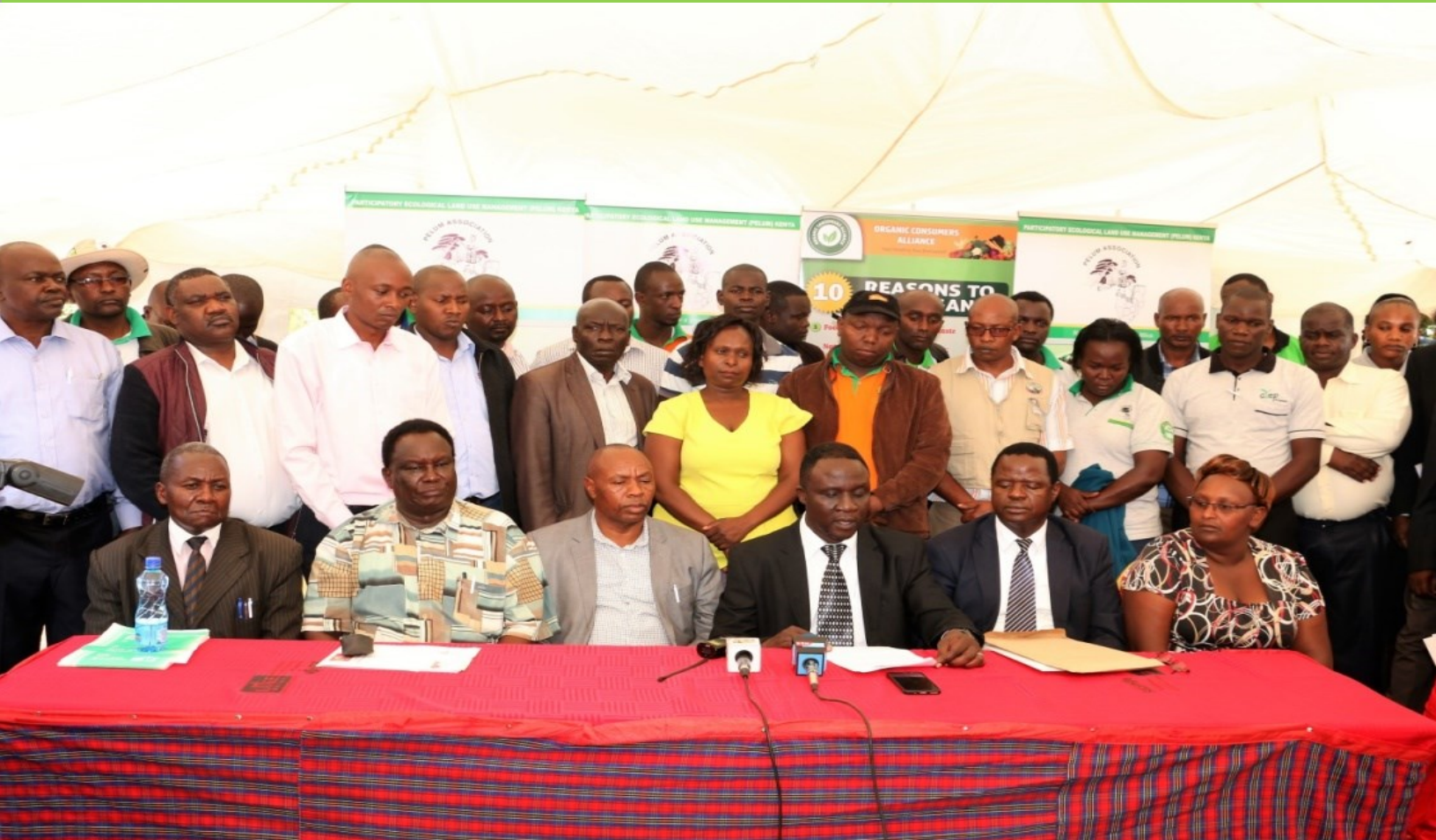
PELUM Kenya Chairman making a Position Statement on Agro Ecology During the Inaugural Networking Symposium in 2018

Theme: Agroecology for Healthy and Climate Resilient Communities