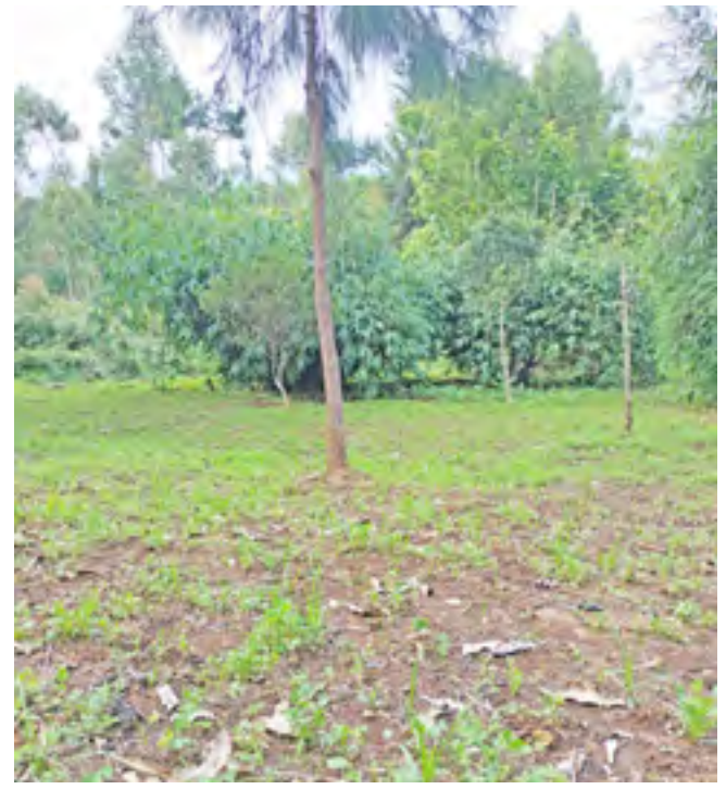
Dhania crop that has been integrated with the forest.

Together, they are not just planting trees; they are cultivating a future where nature and community coalesce in harmony.