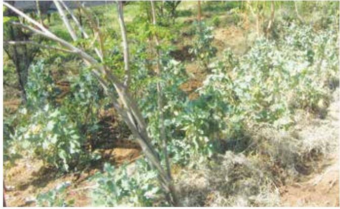
The farm of the same farmer group above located in one of the driest areas of Laikipia North