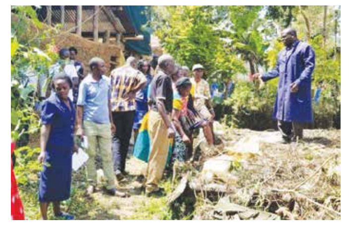
A farmer demonstrating composting technic to participants during zonal exchange visit in Western zone