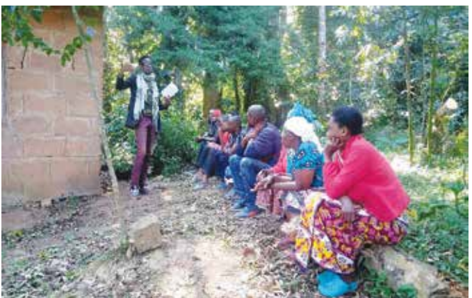
Disseminating the knowledge gained on Agroforestry to Community members found within Chawia forest