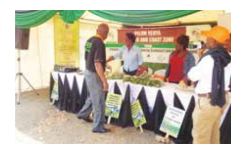
Commemoration of Green Africa Week Livelihood improvement project