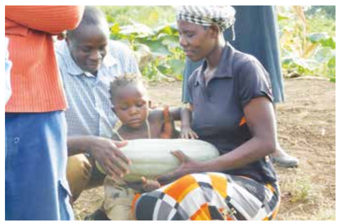
A farmer from CREPP showcasing her organic pumpkin 2018