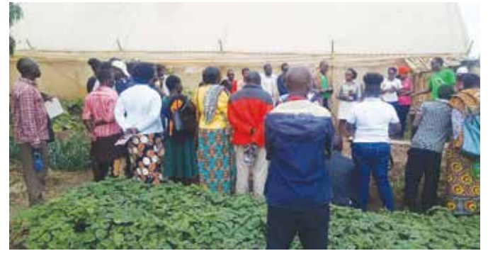
Practical learning is the best approach with the farmers