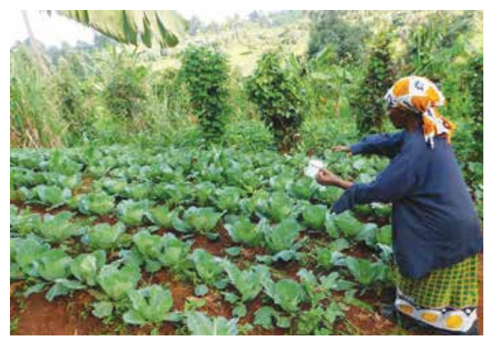
FOSELI project beneficiary at her cabbage farm