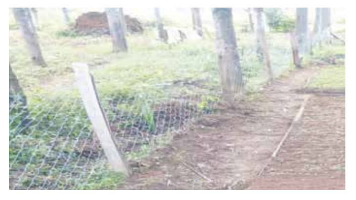
Vacata Nursery ready for planting, 2019

"We have lagged behind in terms of development, because our area is inaccessible. It has been difficult for government officers and other development agencies to reach out to us because of gullies that have rendered our land fragmented and inaccessible. We seem to have been forgotten. We cannot even access Kiu, which is