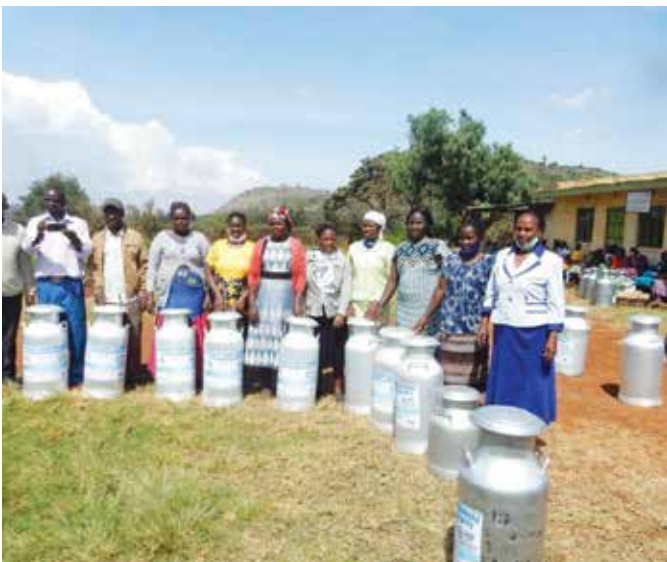
CEFA Kenya Mukindu diary Cooperative group receiving milk cans supported by PELUM Kenya