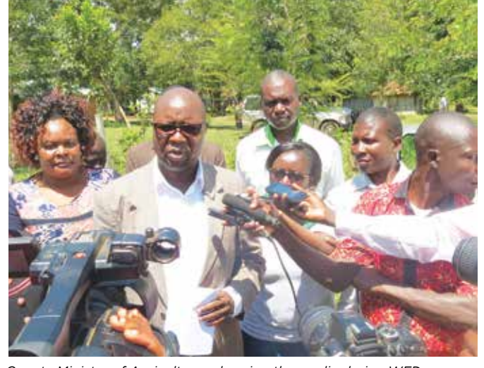
County Minister of Agriculture adressing the media during WFD event