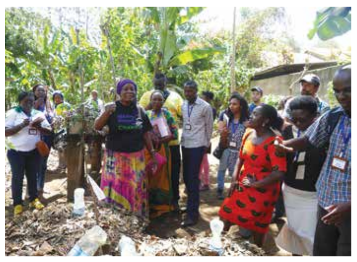
EOAI Youth and Women Exposure and Exchange LEarning visit in Arusha-Tanzania