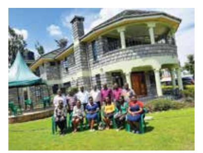
A section of PELUM Kenya staff in their offices during a visit by PELUM Uganda Country Coordinator