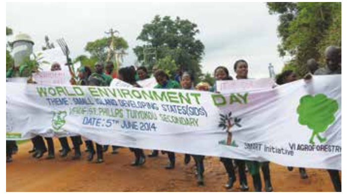
Students from manor House Agriculture Centre during the Procession walk on WED, 2014