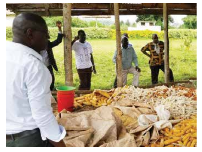
Farm manager at Manor Agriculture Centre talking about seeds to participants during National seed policy sensitization meeting