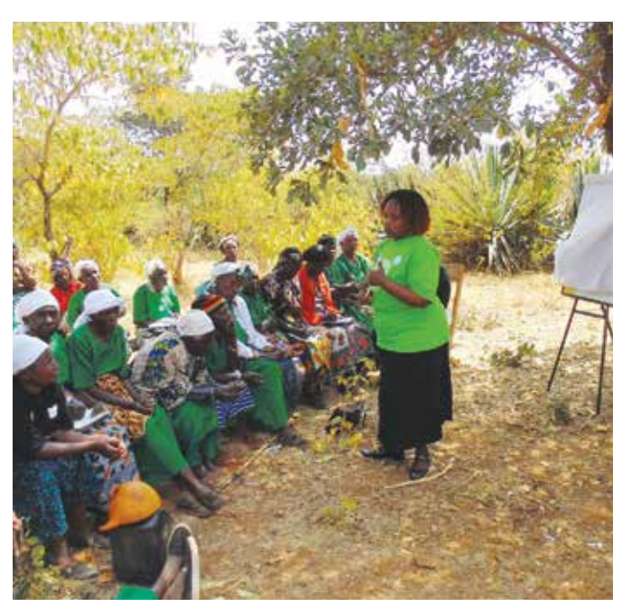
Seed saving baraza with Kithio Kya Mawithyululuko Women group, 2011