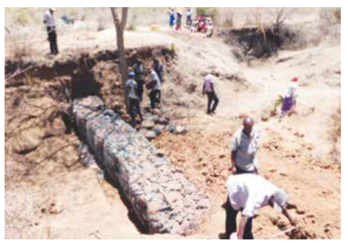
Construction work in progress

Using the skills acquired from the construction of this gabion, the community has mobilized resources and constructed two more gabions; one to stabilize an existing gulley and the other one in the dam to act as silt trap.