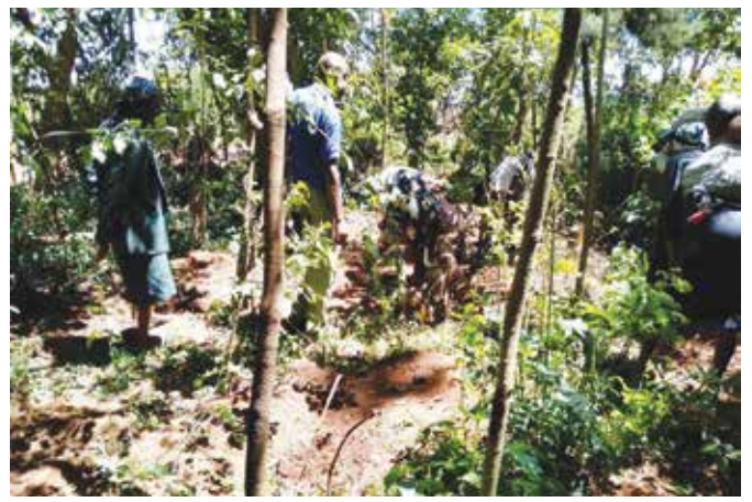
Chingondi Food forest