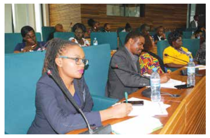
4th EAC Agriculture Summit at EAC Headquarters, Arusha