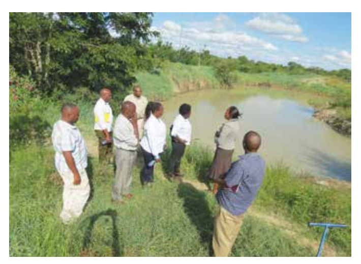
CIM water harvesting