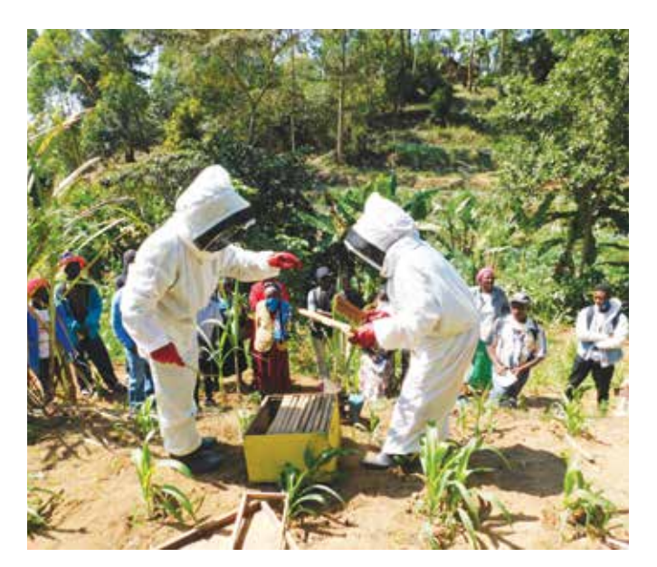
Bee keeping learning session in Wundanyi 2020.