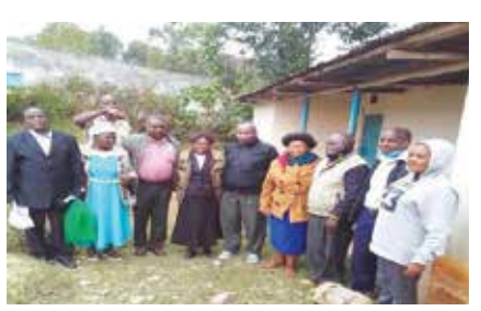
Leaders from different parts of Machakos and Makueni during a networking forum, Katoloni CBO