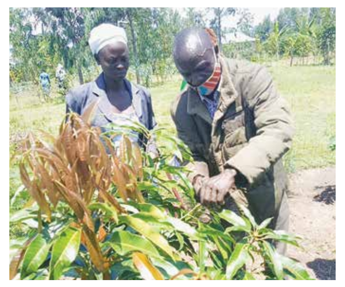
Exchange visit at awasi - grafting of mango demonstration 2020