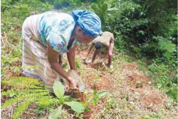
Tree Planting exercise ongoing to rehabilitate the degraded site