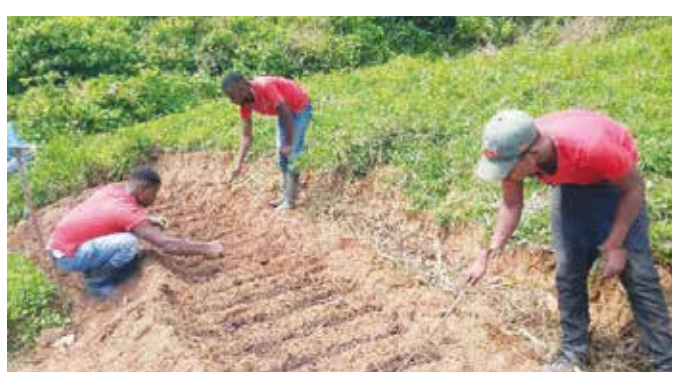
Youths putting into practice what they learnt after the exposure visit by PELUM Kenya

Chawia youth groups specializes in butterfly farming and tree nursery establishment. With support from PELUM Kenya, the group took initiative to rehabilitate Maghombonyi; a water catchment within the forest. Having the idea of upscaling their enterprise they had to provide a conducive ecosystem for the butterflies to breed in large number. This is being achieved through planting of indigenous trees within the water catchment area and within the forest. Currently more than 1500 tree seedlings have been planted within the site.