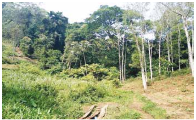
Deforested Maghombonyi water Catchment Tree Planting exercise ongoing to rehabilitate the degraded site