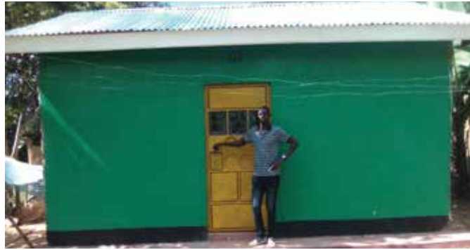
BERMA seed bank for storing indigenous seed. Thanks PELUM Kenya and BIBA- K for the support in its establishment

I therefore, thank PELUM Kenya for the great work they are doing to Berma's small scale farming communities. May Almighty God continue giving you strength. Thank you PELUM Kenya Member Organizations for the great work on promoting the Agro ecological system of farming.